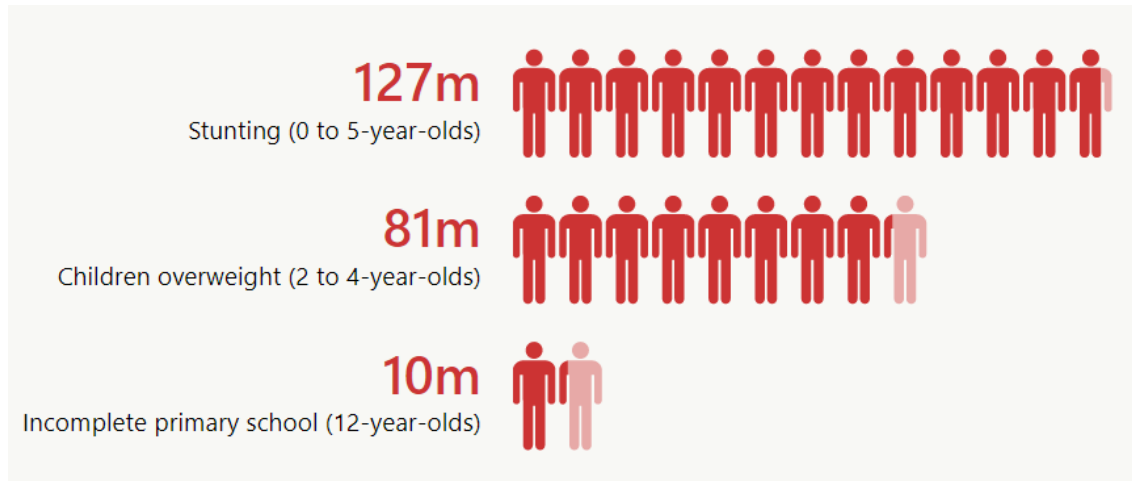
Figure A2: Estimated number of children lacking basic needs in 2030 due to SDG shortfalls