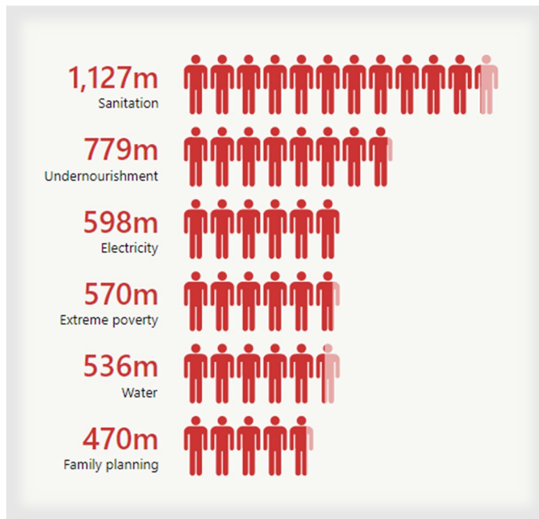
Figure 2: Estimated number of people lacking basic needs in 2030 due to SDG shortfalls

Source: Kharas, McArthur and Onyechi (forthcoming).