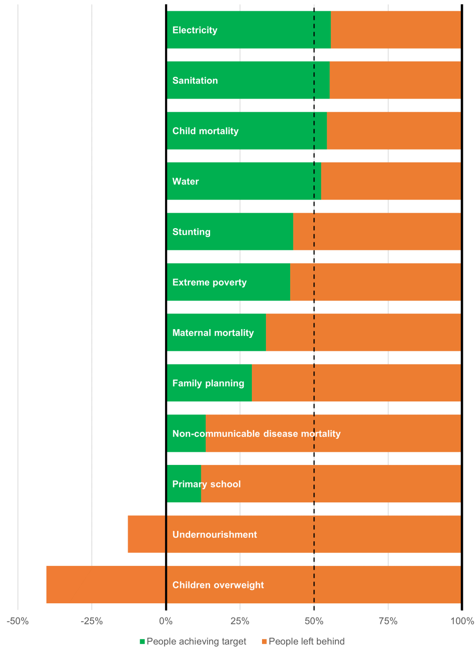
Figure A1: Aggregate SDG performance by 2030 under business-as-usual