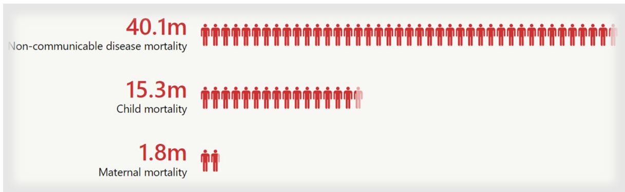
Figure 1: Estimated lives lost due to SDG shortfalls worldwide, current trend, cumulative 2016-2030