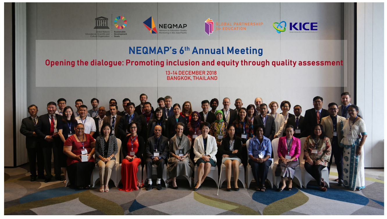
NEQMAP supports OAA through promoting the importance of regional relationships and common understandings

Introduction of assessment of competencies to be taught, prior to that teaching, may appear to be putting the cart before the horse. However, this approach has demonstrated to the NTTs that the way we assess has significant implications for the way we teach and can raise awareness of alternative approaches. If 21CS are to be integrated into school systems, the consequences for both teaching and assessment are considerable. Cambodia, Mongolia, and Nepal have seen this first-hand, and are therefore better prepared to scale teaching and assessment of 21CS in the classroom.