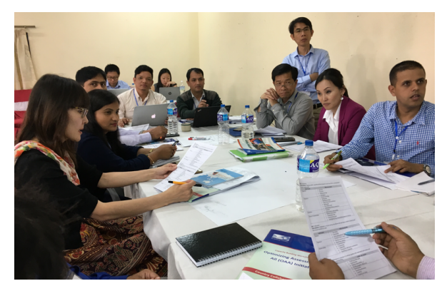
First "all country" OAA meeting in Kathmandu with curriculum comparison and assessment development work ahead

Nepal selected Grade 6 because it is the first grade of lower secondary school and the curriculum had relatively recently been reviewed.