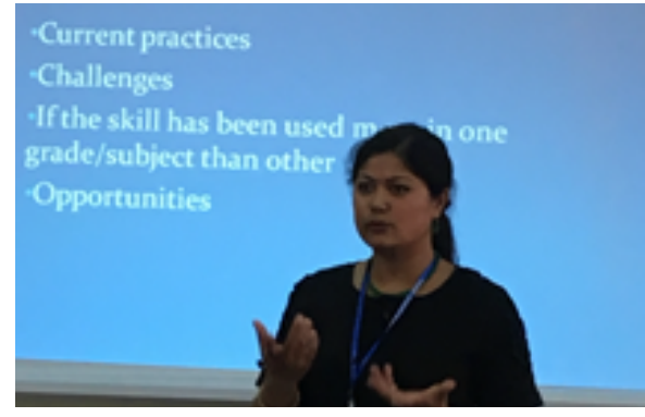
Nepali teacher presenting on challenges to changing practices in the classroom

Overall, teachers believed strongly that 21CS are important to teach, but were concerned about the challenges. However, some teachers noted that participation in the OAA workshop, specifically in defining and decomposing the skills into strands and substrands, had alerted them that they were already teaching some of these skill strands in their classroom, but had not been conscious of it.