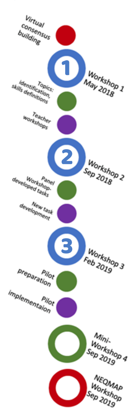
Figure 1. The OAA timeline

The most intensive phase of the OAA Asia work took place over a 20-month period from 2018 to 2019. It included formally convened multi-country workshops, individual in-country workshops and convenings, regional meetings hosted by the Network on Education Quality Monitoring in the Asia-Pacific (NEQMAP), virtual communications, and maintenance of an online platform for document sharing and management. In this report, the experiences of the partner countries are described in the sequence in which they took place. The initiative included working together, consolidating the approach to assessment, and reviewing each other's progress and achievements throughout the process.