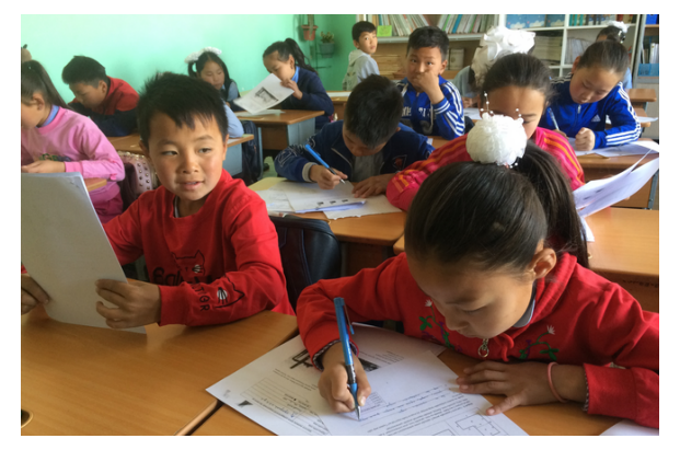
Students in Mongolia engaging in OAA assessment tasks