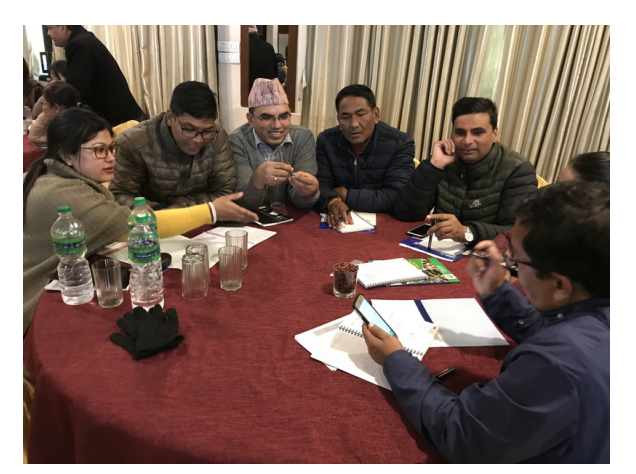
Nepal's Education Review Office educators, and teachers from participating schools in Kathmandu exploring the nature of the targeted skills to assess

The activity itself provided a great deal more information about the tasks and their items. One finding involved the time required for completing the tasks. There had been over-estimates of time needed for critical thinking and problem solving, but under-estimates for collaboration. Another set of findings centered around contextualization became clear, as illustrated by a task based on genetic modifications of food crops.