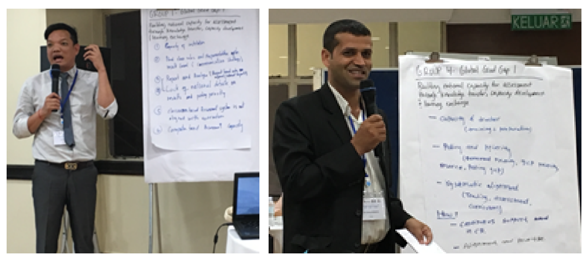
OAA national team representatives from Cambodia and Nepal sharing and leading in NEQMAP regional convening in Penang, Malaysia 2018

As a Nepali teacher stated in the first OAA workshop in Kathmandu, after working through descriptions and definitions of the skills, said "but this means we need to change the way we teach." It is clear that some re-thinking of the classroom culture is necessary for some teachers and education systems. Concerns expressed during the pilot about students cheating highlight some of the complexities associated with collaborative work, about not always prioritizing correct answers, and about building knowledge together as opposed to competitive systems in which being ranked provides benefits to some and deprives others of opportunities.