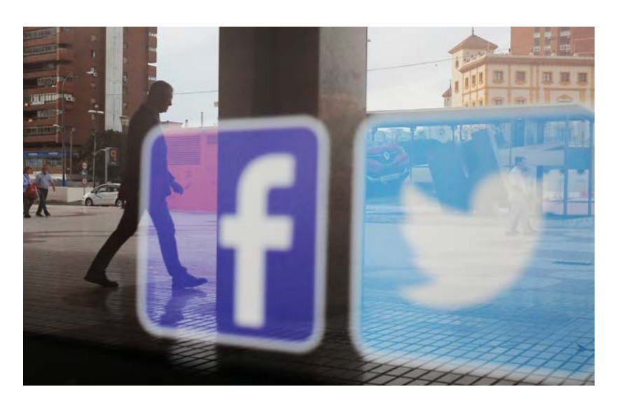
Facebook and Twitter logos are seen on a shop window in Malaga, Spain.

sentenced to jail time. In the time since, the government's security services have intensified their repressive efforts with nation-wide raids on opposition movements' offices.<sup>314</sup>