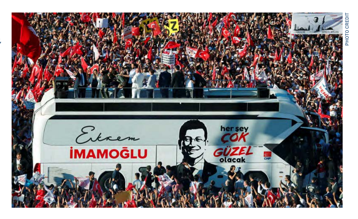
Mayor of Istanbul Ekrem Imamoglu of the main opposition Republican People's Party (CHP) and his wife, Dilek, greet supporters from the top of a bus outside City Hall in Istanbul, Turkey.