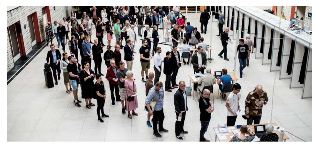
People queue to enter the voting booths at a polling station during the parliamentary elections in Odense, Denmark.