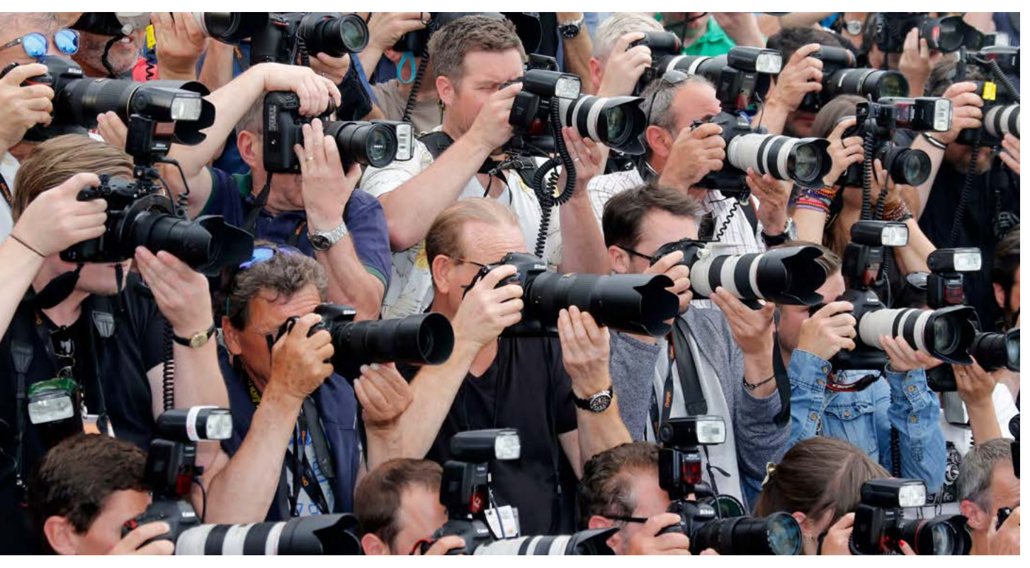
Press photographers take pictures in France.

• Financial independence and sustainability. Finally, where possible, media outlets should seek to avoid capture by state and state-affiliated funders. In Hungary and Serbia, for instance, pro-government actors have acquired prominent media entities and used advertising and other financial means to gain leverage over other press organizations. To maintain independence, media actors in backsliding nations should explore alternative funding models such as crowdfunding, subscriptions, paywalls, and grants. 161