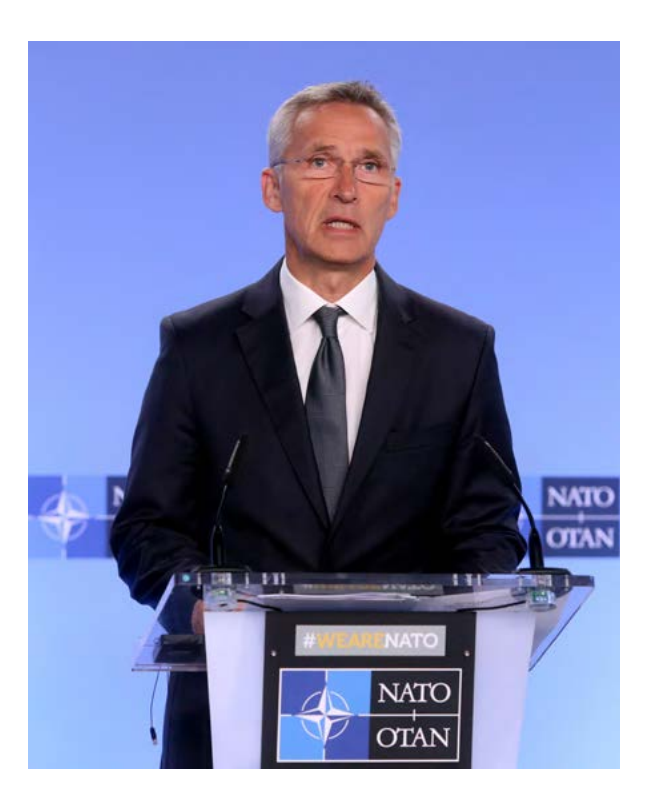
NATO Secretary-General Jens Stoltenberg gives a news conference in Brussels, Belgium.

to link overall levels of EU funds provided to a member state to a rule of law index, whereby states that score higher on the index have greater access to funds. This would employ an incentive process rather than a punitive approach.<sup>349</sup> The definitions and measurements of such a rule of law index could be established according to rulings of the European Court of Human Rights and with reference to the opinions of the Council of Europe's Venice Commission that has already conducted reviews of numerous problematic policies in Hungary and Poland.<sup>350</sup>