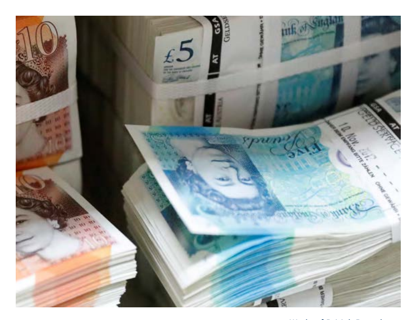
Wads of British Pound Sterling banknotes are stacked in piles in Vienna, Austria.

Corporate philanthropy is another way that businesses can work to strengthen democratic principles. Nike's global Community Impact Fund, for example, partners with several community-based organizations in both the United States and Europe to support grassroots movements that work to provide equal opportunity for children. 194 Corporations can also work to bolster the rule of law and government accountability. General Electric, for example, contributed to government reform in emerging markets by meeting with business leaders, NGO leaders, and government officials