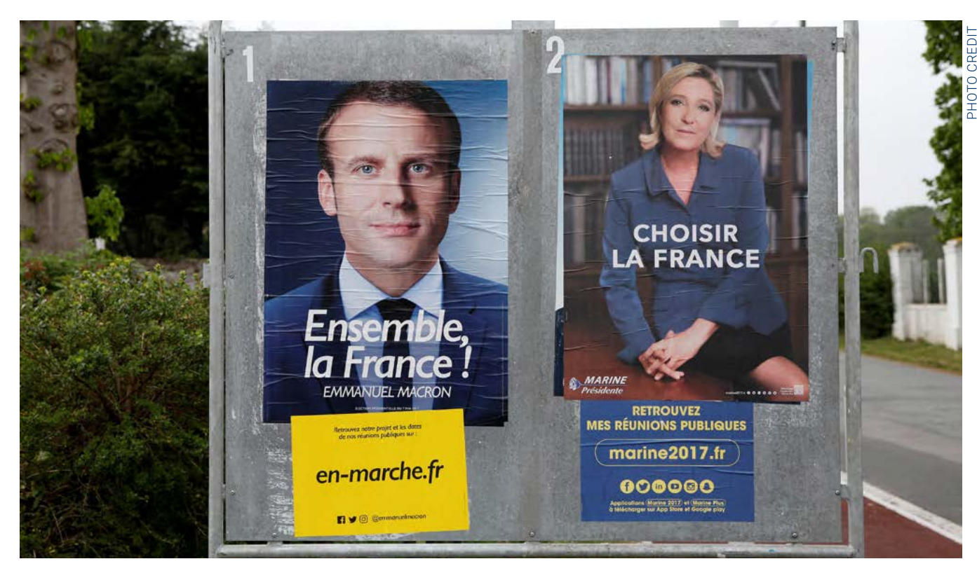
Official posters of the candidates for the 2017 French presidential election, Emmanuel Macron (L) and Marine Le Pen, are displayed in northern France.

For example, in Poland, the ruling Law and Justice (PiS) party has brought the country close to "a point of no return concerning the independence of its judiciary." 53 While serving as prime minister from 2015 to 2017, Beata Szydło packed the courts with new judges, reorganized the Constitutional Tribunal to decrease power, and changed decision-making rules to "paralyze the court."54 Among several new laws designed to cripple judicial independence was a 2015 amendment that required a two-thirds majority for binding decisions and raised the quorum to hear cases from nine to 13.55 Since the court had only 12 justices at the time, the rule rendered the body effectively inoperable. The PiS has in recent years continued to chip away at judicial integrity through action as well as legal changes: it forcibly removed upwards of 149 regional court officials for "discretionary" reasons, appointed poorly qualified replacements, has delayed the adjudication of cases, and re-shaped National Council of the Judiciary (created to ensure judicial independence) with political appointees.<sup>56</sup>