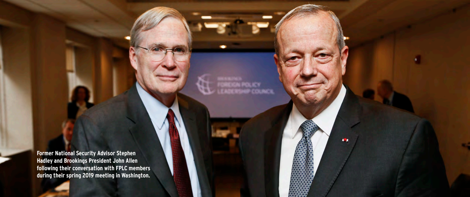
Former National Security Advisor Stephen Hadley and Brookings President John Allen following their conversation with FPLC members during their spring 2019 meeting in Washington.