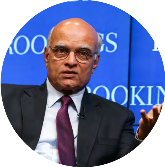
ABOVE: Brookings Distinguished Fellow and Former National Security Advisor to the Prime Minister of India and Foreign Secretary Shivshankar Menon.