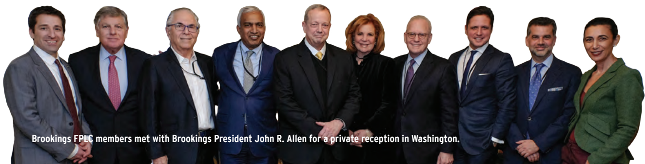
Brookings FPLC members met with Brookings President John R. Allen for a private reception in Washington.