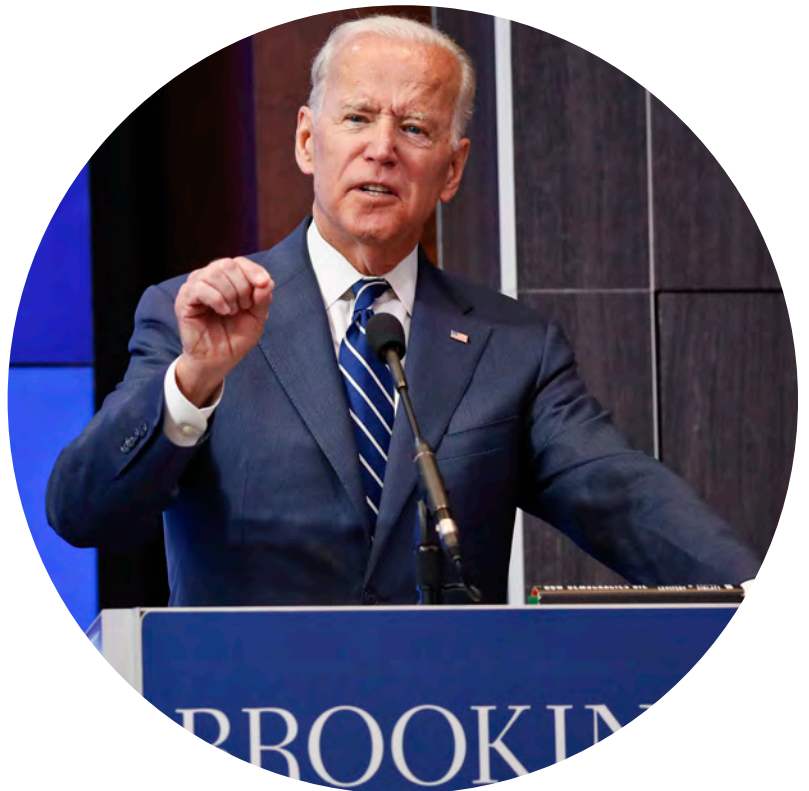
RIGHT: Former Vice President of the United States Joseph R. Biden.