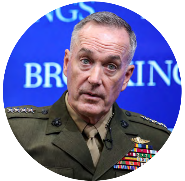
BELOW: Chairman of the Joint Chiefs of Staff General Joseph Dunford.