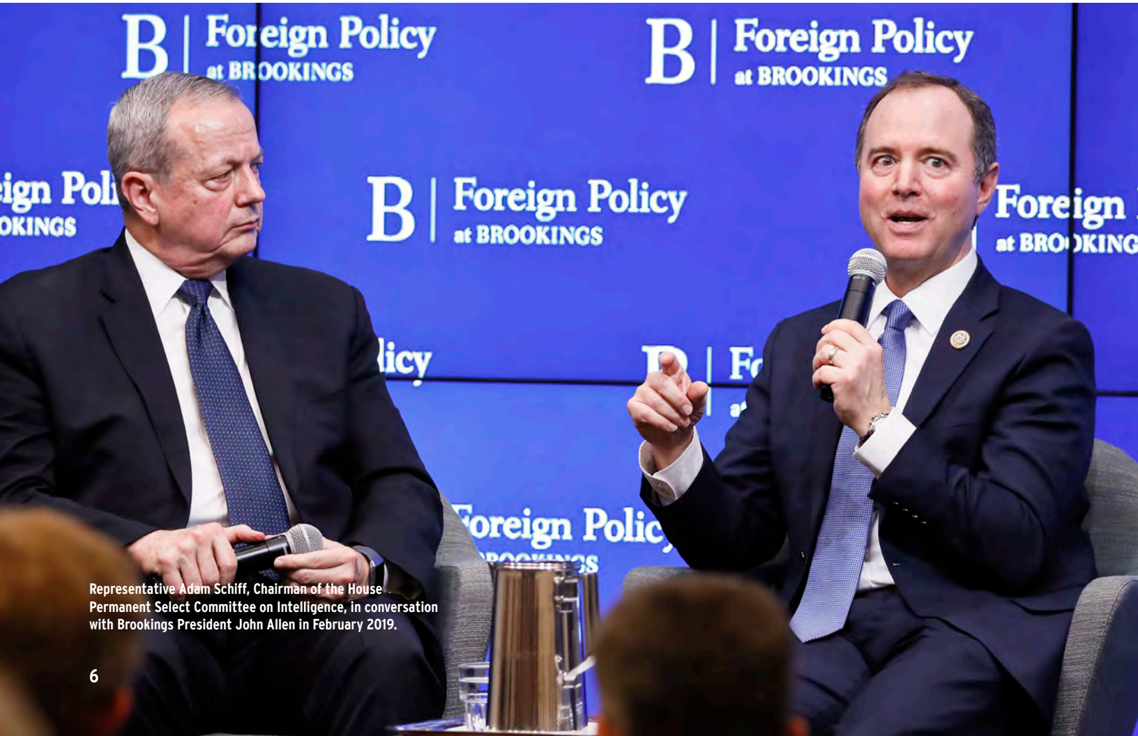
Representative Adam Schiff, Chairman of the House Permanent Select Committee on Intelligence, in conversation with Brookings President John Allen in February 2019.