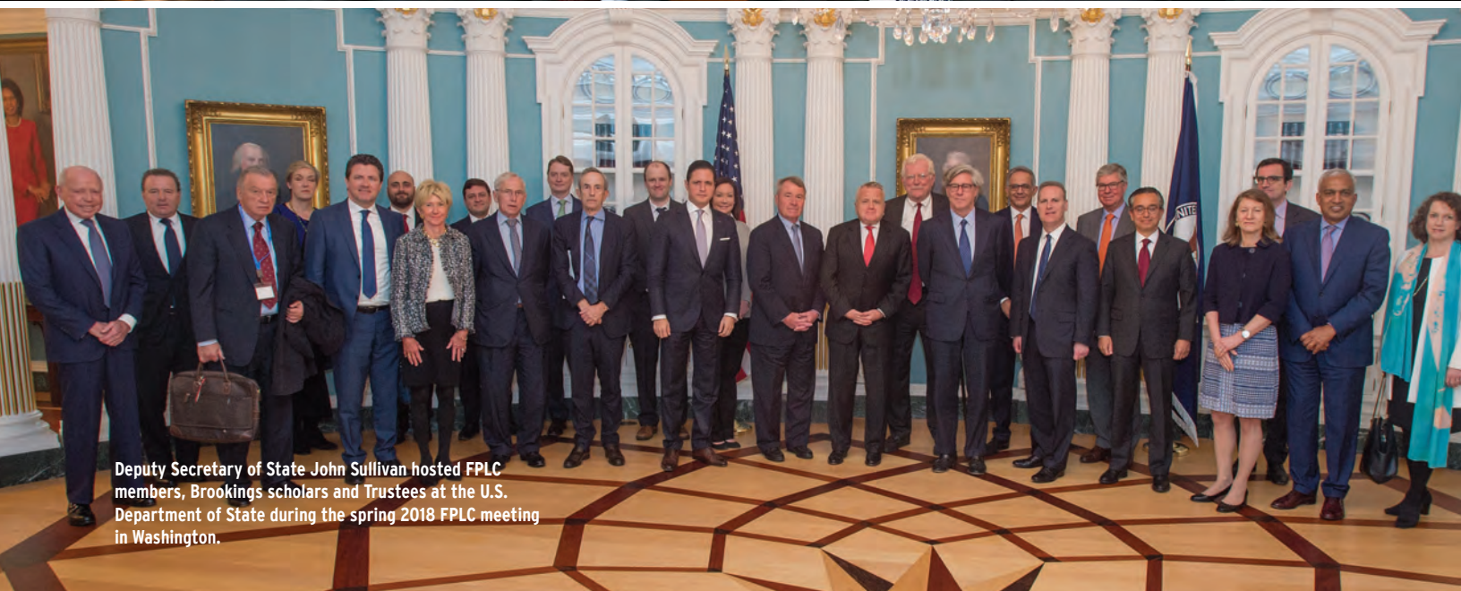
Deputy Secretary of State John Sullivan hosted FPLC members, Brookings scholars and Trustees at the U.S. Department of State during the spring 2018 FPLC meeting in Washington.