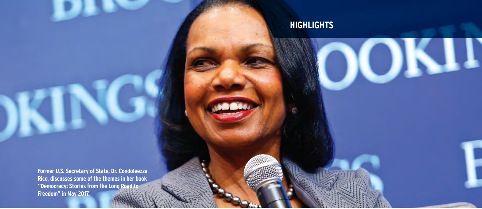
Former U.S. Secretary of State, Dr. Condoleezza Rice, discusses some of the themes in her book "Democracy: Stories from the Long Road to Freedom" in May 2017.