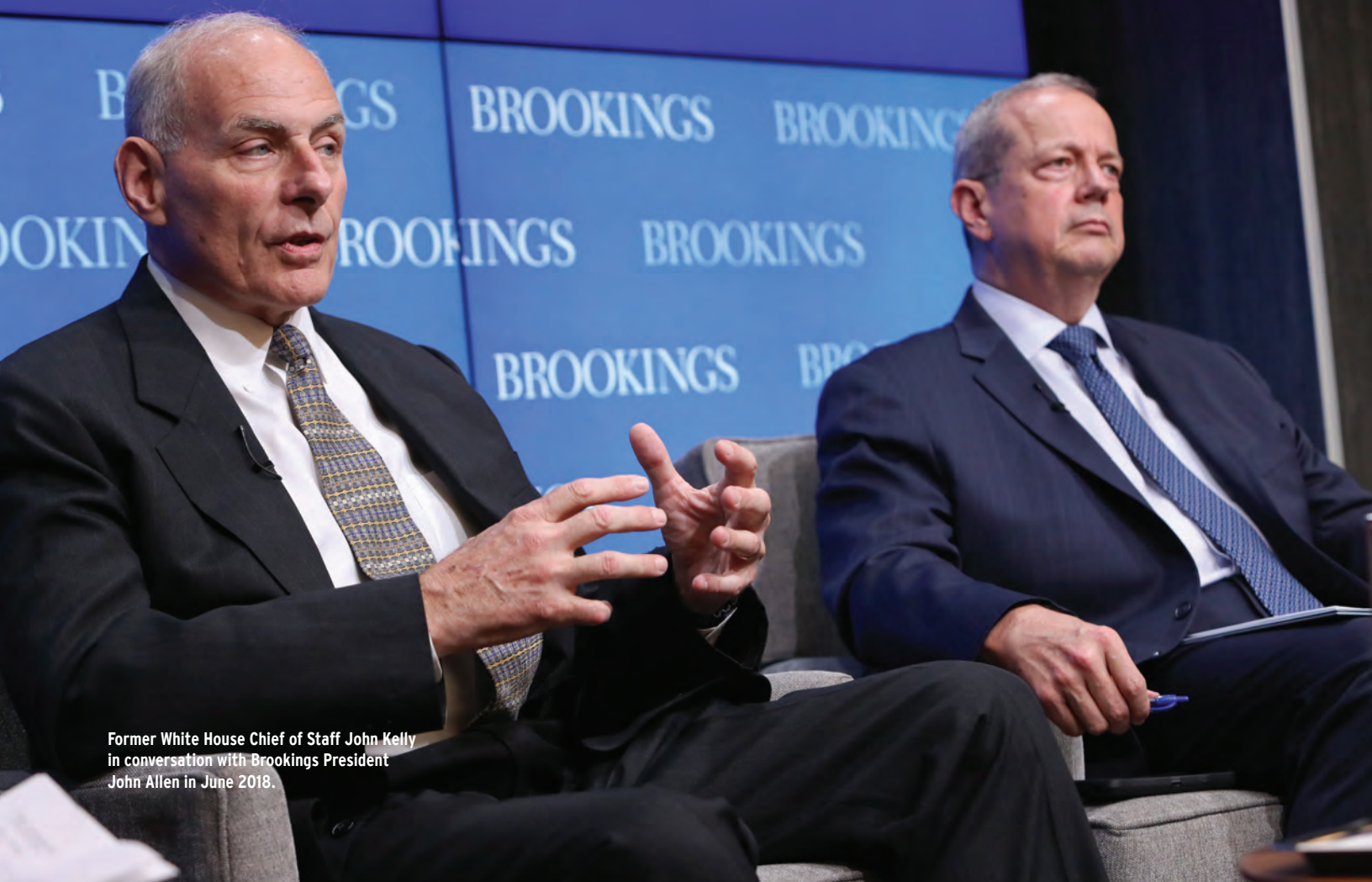
Former White House Chief of Staff John Kelly in conversation with Brookings President John Allen in June 2018.