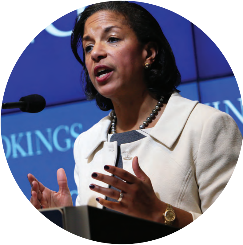
LEFT: Former National Security Advisor Susan Rice.