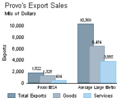
Brookings Institution analysis of various data for Provo-Orem, UT MSA.

Provo produces $1.8 billion in total exports. As a share of its total economy, 12.7 percent of what it produces was exported in 2008, supporting 17,477 jobs. Recent export growth in Provo has been robust, expanding at 17.5 percent. Average wages in its largest export industry were $60,289, above the U.S. average. The metro has 12 export industry clusters. Finally, its major export industries are Primary Metal Manufacturing, Computer and Electronic Product Manufacturing, Business, Professional, and Technical Services, Chemical Manufacturing, and Royalties from Intellectual Property.