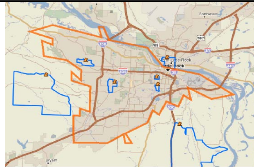
City of Little Rock

Communities with low access to supermarkets outlined in blue