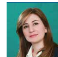
Vian Dakhil IRAQ