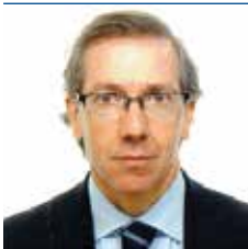
Bernardino León SPAIN