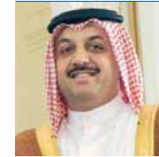
Khalid Bin Mohammed Al Attiyah QATAR

Khalid Bin Mohammed Al Attiyah is the Minister of Foreign Affairs of the State of Qatar. Prior to his appointment, he served as minister of state for foreign affairs and was a member of the Council of Ministers for two years. In 2009, he was chairman of the board of directors of Qatar's Stock Exchange, vice chairman of the Supreme Council for Information Technology and Communications and Qatar Financial Center Authority, and acting minister of business and trade. He also served as minister of state for international cooperation in 2008. From 1987-95, Al Attiyah was a fighter pilot in Qatar's Emiri Air Force. Al Attiyah received his bachelor's in Aviation Studies from King Faisal Air Academy, a degree in Law from Beirut Arab University, a master's in Public Law, and a doctorate in Law from Cairo University.