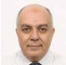
Amr Darrag EGYPT

Democratic Party of Kurdistan, is Iraq's only Kurdish Yazidi MP. From 2010-2014, she was a member of the Iraqi Council of Representatives, where she represented the Kurdistan Alliance. In August 2014, Dakhil gained international recognition after delivering a speech in the Iraqi parliament calling for assistance to Yazidi populations besieged by the Islamic State of Iraq and Syria (ISIS) in the Sinjar region of Iraq. She has continued to speak out for the rights and welfare of Yazidi women who have been victimized by ISIS. Dakhil holds bachelor's and master's degrees in Microbiology from Salahuddin University.