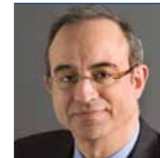
Marwan Muasher JORDAN

Ayman Mohyeldin is a Foreign Correspondent for NBC News and an anchor for MSNBC . He is also the host of the news program "Roadmap" on MSNBC's digital channel, Shift. He has previously worked with Al Jazeera and CNN . Ayman has won numerous international press awards, including a Peabody Award. In 2011, he was named by Time magazine as one of the "100 Most Influential People in the World." Mohyeldin earned his B.A. in International Relations and an M.A. in International Politics from American University School of International Service.