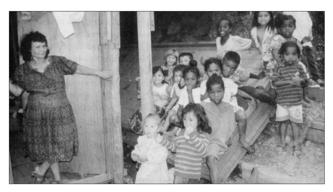
Internally displaced children living in a shantytown on hills above Medellin, Colombia.