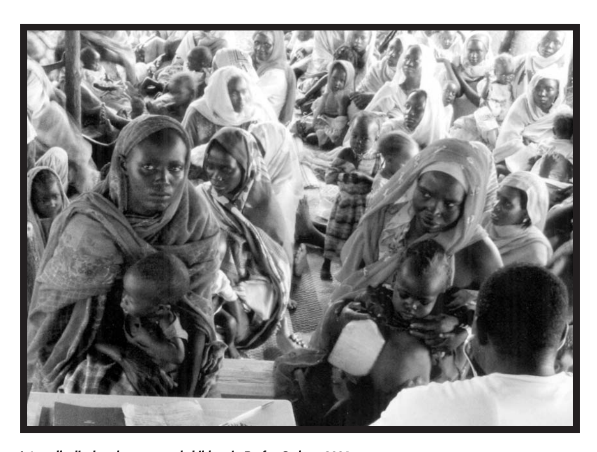
Internally displaced women and children in Darfur, Sudan - 2004.