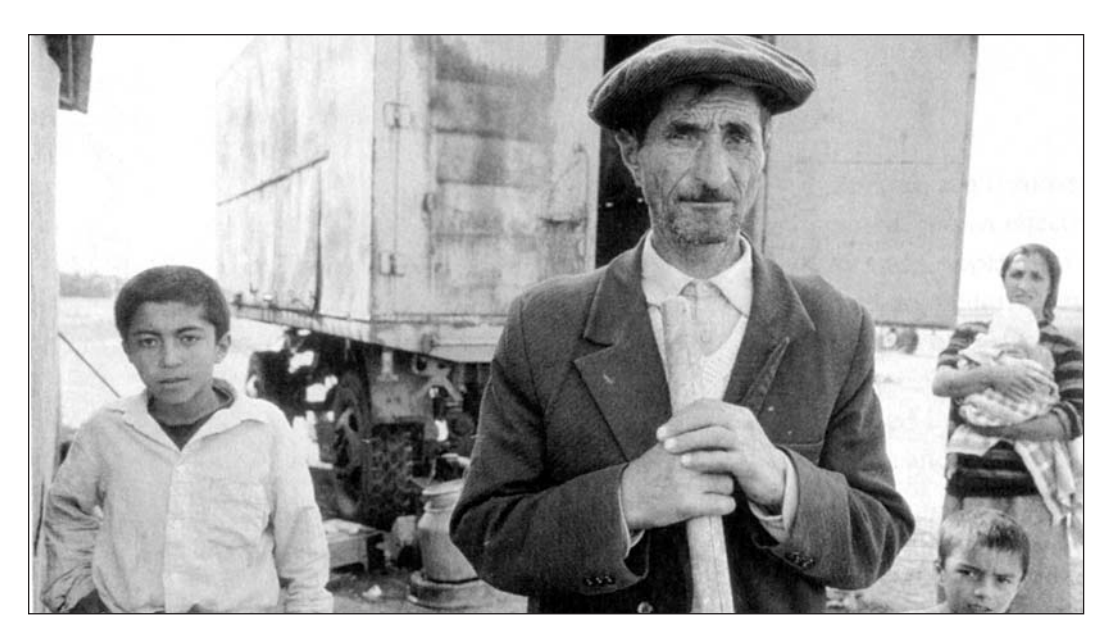
An old trailer near Yevlakh, Azerbaijan, was the only shelter that this Azeri family, displaced by fighting in 1994 between Armenia and Azerbaijan, could find.