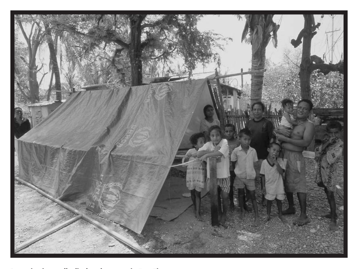
Returning internally displaced persons in East Timor.