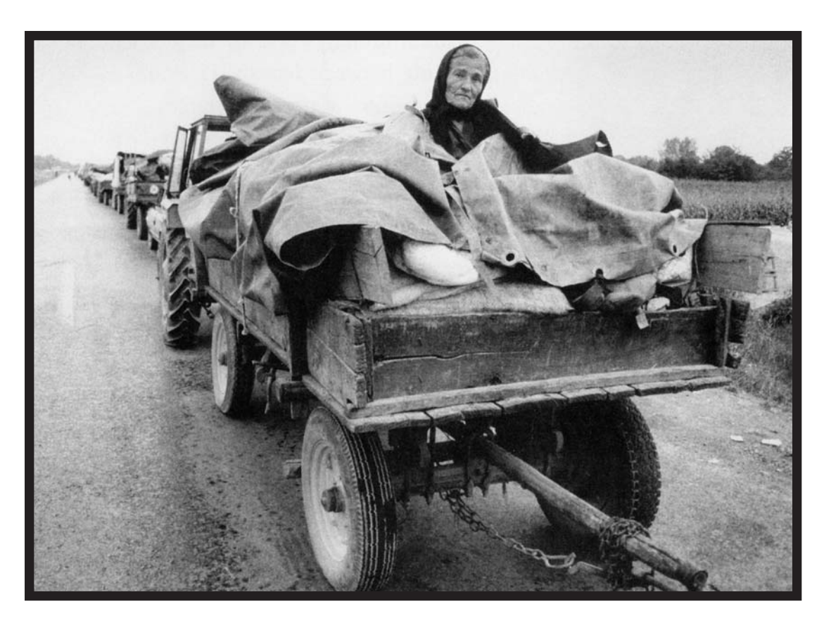
In the former Yugoslavia Krajina Serbs in August 1995, on the road between the frontier post of Badovinci and the town of Sabac, fled carrying with them only bare essentials.