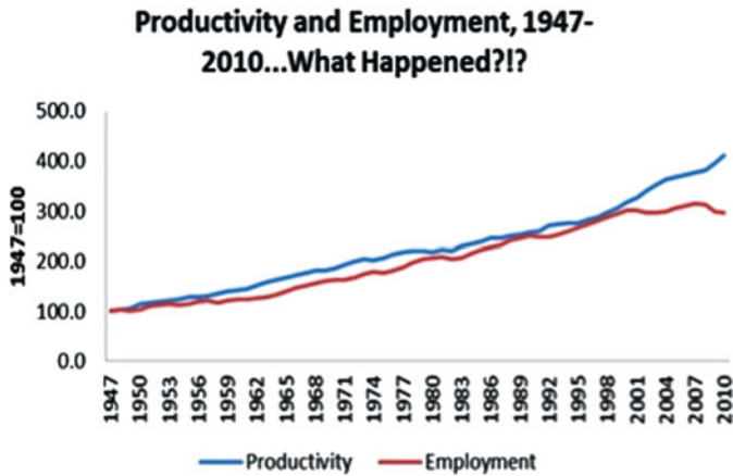
Figure 2. Productivity and Employment, 1947–2010.

unskilled workers have traditionally found jobs, giving rise to a permanent underclass of unemployment.