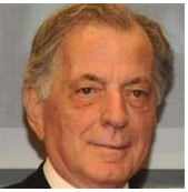
Itamar Rabinovich is a Distinguished Fellow at the Center for Middle East Policy at Brookings.

In Israel, debates over the state's identity, its place and role in the region, and the more specific issues of the future of the West Bank and Israel's relationship with the Palestinians, govern the country's politics and national discourse. The March 2015 Israeli elections are being conducted over a wide range of issues, but they are seen first and foremost as a referendum on these key questions. Politics and policy can hardly be separated. Appearances can be misleading. Currently, the focus of the election campaign seems to be on socio-economic issues. The main challenger of Netanyahu's current government and potential right-wing coalition is "The Zionist Camp" led by Isaac Herzog and Tzipi Livni. They are strong advocates of reviving a peace process with the Palestinians, but they realize that the Israeli public has drifted to the right. Furthermore, the primaries in the Labor Party produced a left-leaning list of candidates. But whatever the current drift of the campaign, in the elections' immediate aftermath, whoever forms the next government will have to deal primarily with the Palestinian issue and the national security challenges facing the country.