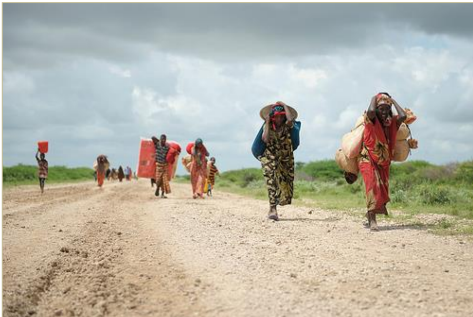
Carrying whatever possessions they can, women arrive in a steady trickle at a camp for IDPs established next to a base of the African Union Mission for Somalia near Jowhar (November 12, 2013).

2.3 The Global Protection Cluster should assess how these strategic reflections are going and make the necessary changes to ensure that the clusters are continually dealing with new challenges which come their way. It might be helpful, for example, to have a team of external consultants work with the clusters in developing these plans or to hold the cluster leads individually responsible for ensuring that this strategic review is carried out or to circulate these strategic plans between protection clusters for ‘peer review’ critique.