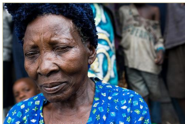
An IDP woman at a camp in North Kivu Province, DRC (UN Photo, Marie Frechon, February 16, 2008).

Although there is now much greater awareness of protection than when Protect or Neglect was published, there are signs that internal displacement is slipping off the international agenda. There is a danger of losing progress made on IDPs over the past two decades. The trend toward mainstreaming, the decreasing visibility of IDPs on the international agenda, the decline in numbers of staff focusing explicitly on IDPs in international organizations such as UNHCR, OCHA, and ICRC and the weakening of the position of Special