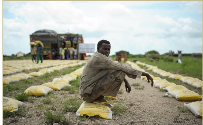
A Somali man rests on a bag of food aid (UN Photo, Tobin Jones, November 12, 2013).

leadership, but it is important to emphasize that the impact of protection efforts in Somalia is incremental at best. Major challenges include addressing aid diversion and gatekeepers as well as coping with shifting IDP populations given trends in evictions, relocation and returns. Other areas needing continual attention are gender-based violence and child protection as well as developing humanitarian linkages with long-term development initiatives, as is currently being piloted by the Solutions Alliance. Humanitarian leaders express optimism that the Somali government's New Deal initiative, which emphasizes stabilization and long-term development goals, will provide a vehicle for more effective coordination between relief agencies and development experts.