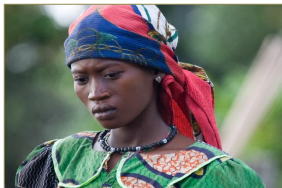
An IDP woman at Bompata Encampment in DRC (UN Photo, Marie Frechon, March 11, 2007).

For over two decades, large numbers of people in DRC have been displaced from their homes, often repeatedly, as a result of persistent conflict. The waves of violence have been so chronic over the years that displacement has touched nearly every inhabitant living in the eastern provinces. Although figures have fluctuated, the number of IDPs has generally hovered around the two million mark for over a decade, with an estimated 2.6 million displaced in 2014 – most of whom do not live in settlements but are dispersed among the local population.