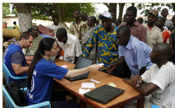
Representatives from the International Organization for Migration conduct registration for IDPs at in Bangui, CAR. (IOM, Sandra Black, March 2, 2014.

ten-year period – e.g. poverty, protection, health, livelihoods. This is due to the lack of basic data – as well as of disaggregated data by gender and age. There are inconsistencies in the way data is collected which are related to conceptual differences in definition (for example, are children of IDPs counted as IDPs? How are secondary and multiple displacements counted?) There are difficulties in monitoring displacement over time as well as gaps in the types of data collected by national governments and a range of international organizations who carry out assessments at different times and for different purposes. Too often this information is not made publicly available, leading to both a paucity of timely information and to duplication of data-collection efforts. While there are exciting new technologies which offer hope for more accurate data-collection, further work is equally essential (though perhaps less-exciting) on how the data will be disseminated and used, especially by governments of affected countries.