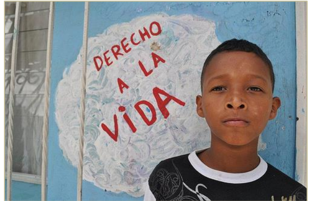
A Colombian internally displaced child (Save the Children, November 30, 2012).

Colombia is a country of paradoxes. While the number of IDPs has increased from 2 million in 2004 to over 6 million in 2014 (and currently ranks second only to Syria in the scale of displacement), the government has taken impressive steps not only to address the needs of IDPs but to bring an end to the long conflict with guerrilla groups. The government has developed perhaps the world's most comprehensive legal system for IDPs, the constitutional court has played an impressively assertive role in protecting IDPs and civil society organizations in Colombia are among the world's strongest. However, there are parts of the country, including parts of major urban centers, that are inaccessible to humanitarian actors and to the state. Criminal gangs, paramilitaries, narcotráfico groups, cartels, guerrillas, and other non-state actors have become the major drivers of displacement and present particular challenges to humanitarian actors. Displacement within cities, for example, is increasing as a result of violence committed by gangs and other non-state actors.