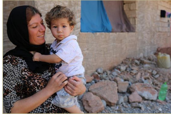
Mother and child from Mosul at a displacement site in Koysinjaq, Iraq (IOM, Taryn Fivek, September 15, 2014).

humanitarian operations in situations of open conflict, a balance between the two is probably the only way forward. Yet there needs to be a regular opportunity or mechanisms for humanitarian actors to step back and reflect on whether particular humanitarian programs should be continued.