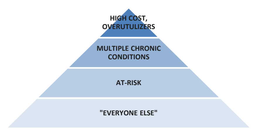
Figure 1: The Patient Utilization Pyramid

TIER 1 - HIGH COST, OVERUTILIZERS: Overall, the top 1 percent of patients account for about 20 percent of total costs, and the top 5 percent of patients account for 50 percent of total health spending. <sup>14</sup> Thus, there are many opportunities to use stratification and prediction methods to identify those costly patients, and then intervene through care management or care coordination. Research has shown that care management can reduce health costs for this population, mainly through reducing ED visits and hospitalizations. <sup>15</sup>