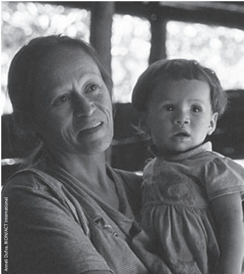
IDPs in Colombia.

and other key indicators so that the specific needs of particular groups of IDPs can be taken into account. Attention must be given to the different causes of displacement. Furthermore, information is needed not only on IDPs in emergency situations but also on those in protracted situations of displacement. It should be noted that data collection and registration processes must in no way put at risk the security of the displaced or affect their legal entitlement to enjoy the protection and assistance of their government.