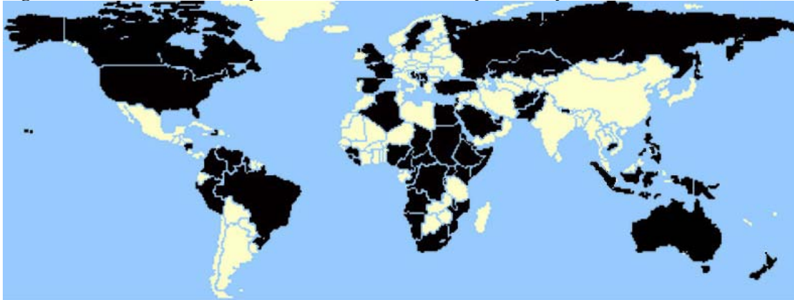
Figure 1: The Global Activity of the Privatized Military Industry, 1991-2001

(Areas where PMFs have been active in bold )