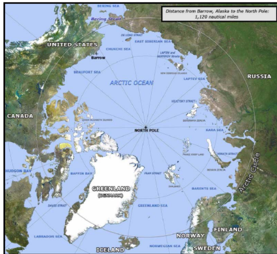
Figure 1: Arctic Ocean (United States Navy graphic)