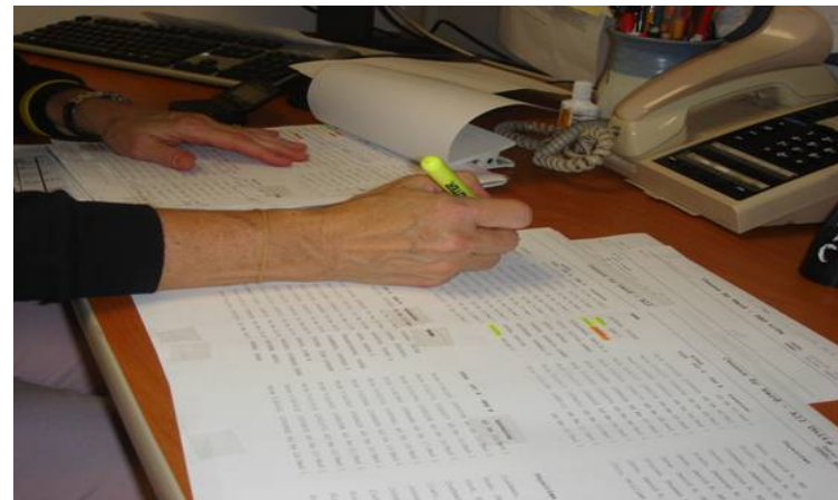
Transferring information from the old clipboard