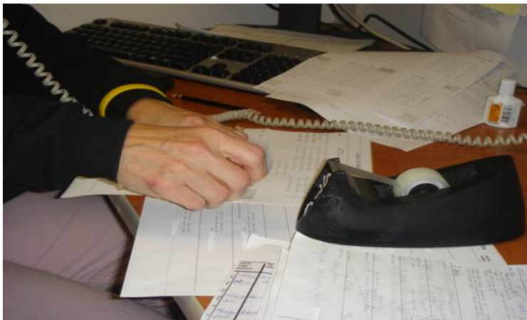
Taping print-outs of two adjacent units