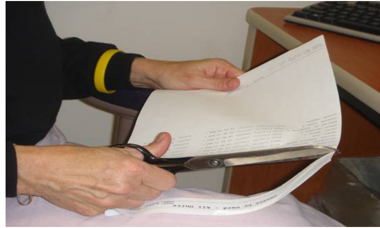
Cutting out unnecessary parts