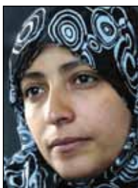
Tawakkol Karman YEMEN