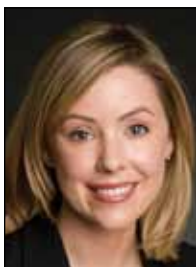
Elizabeth Ryan UNITED STATES

She is the author of Willful Blindness: the Bush Administration and Iraq . In 2001 Rubin was a finalist for the Pulitzer Prize in commentary for her columns on the Israeli-Palestinian conflict, and in 2008, she was awarded the Edward Weintal prize for international reporting. In 2010 she won the Arthur Ross award for international commentary from the Academy of American Diplomacy. She is a graduate of Smith College and the London School of Economics, and a former Fellow at Harvard University's Weatherhead Center for International Affairs.