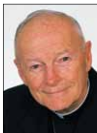
Theodore McCarrick UNITED STATES