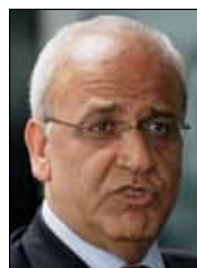
Saeb Erekat PALESTINE