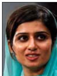
Hina Rabbani Khar PAKISTAN