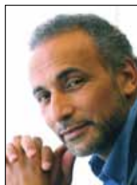
Tariq Ramadan UNITED KINGDOM