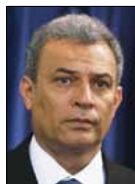
Ziad Abu-Amr PALESTINE