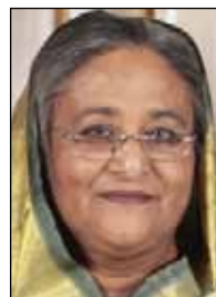
Sheikh Hasina BANGLADESH