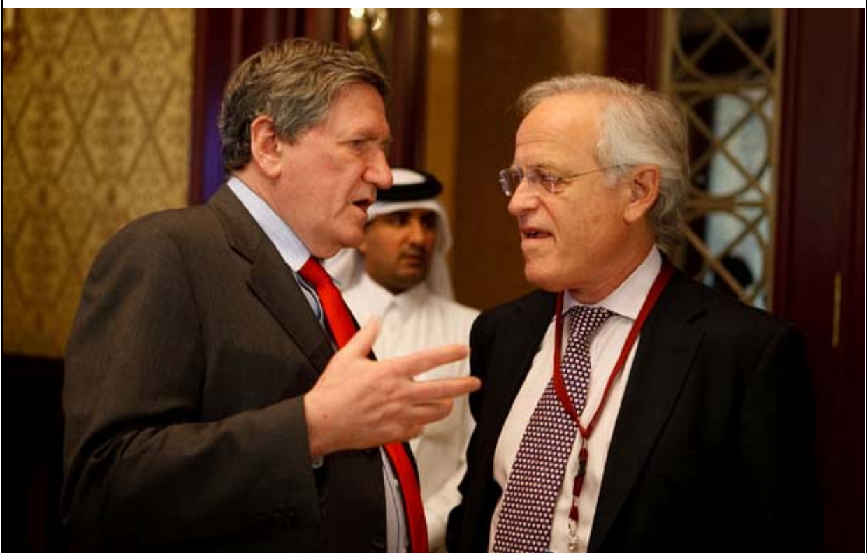
Ambassador Holbrooke converses with Ambassador Indyk