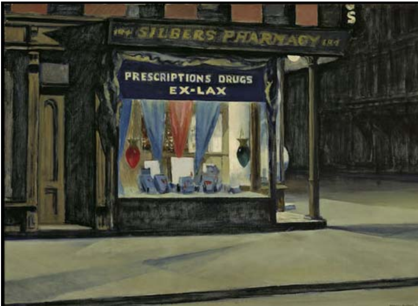
Stealth prescription pick-up