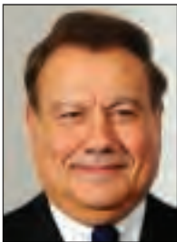
Jaloul Ayed TUNISIA

Ahmad bin Abdullah Al-Mahmoud is Minister of State for Foreign Affairs of the State of Qatar. He is also a Member of the Council of Ministers, has been Chairman of the country's Development Fund since February 2010, and is the Deputy Chairman of the Board of Trustees of the University of Qatar. Minister Al-Mahmoud also serves as Chairman of the Permanent Committee of Projects for the Development of the Ministry of Foreign Affairs. Prior to becoming Minister of State for Foreign Affairs in 1995, Minister Al-Mahmoud was Undersecretary in the Ministry from 1989 until 1995. He was Qatar's Ambassador to the United States from 1987 until 1989, Qatar's Ambassador to Oman from 1984 until 1986, and Charge d'affairs in Qatar's Embassy in Algeria in 1983. Prior to these posts, he headed the Economic Affairs Section in the Ministry of Foreign Affairs. Minister Al-Mahmoud has a B.A. in Arabic and Islamic Studies from Cairo University and an M.A. in Economics from Central Michigan University.