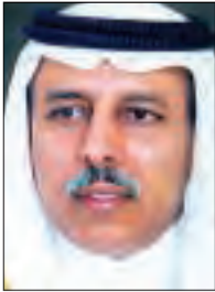
Ahmad bin Abdullah Al-Mahmoud QATAR

Ahmad bin Abdullah Al-Mahmoud is Minister of State for Foreign Affairs of the State of Qatar. He is also a Member of the Council of Ministers, has been Chairman of the country's Development Fund since February 2010, and is the Deputy Chairman of the Board of Trustees of the University of Qatar. Minister Al-Mahmoud also serves as Chairman of the Permanent Committee of Projects for the Development of the Ministry of Foreign Affairs. Prior to becoming Minister of State for Foreign Affairs in 1995, Minister Al-Mahmoud was Undersecretary in the Ministry from 1989 until 1995. He was Qatar's Ambassador to the United States from 1987 until 1989, Qatar's Ambassador to Oman from 1984 until 1986, and Charge d'affairs in Qatar's Embassy in Algeria in 1983. Prior to these posts, he headed the Economic Affairs Section in the Ministry of Foreign Affairs. Minister Al-Mahmoud has a B.A. in Arabic and Islamic Studies from Cairo University and an M.A. in Economics from Central Michigan University.