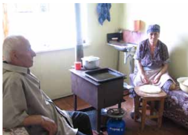
An internally displaced couple in the collective centre unit which they now own after living there for 15 years (Photo: IDMC/Nadine Walicki, July 2010).

A final panel focused on good practices for UN agencies, NGOs and national human rights institutions in supporting local integration in protracted displacement.