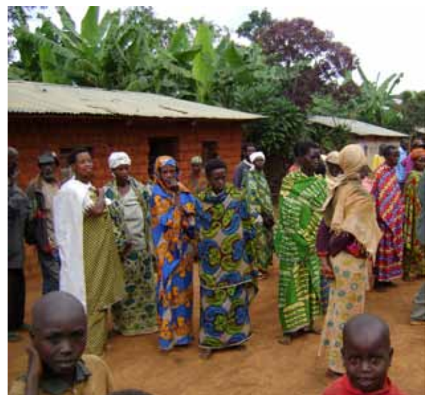
Residents of a settlement for vulnerable groups including IDPs in Kigoma, Burundi (Photo: IDMC/Greta Zeender, June 2010).