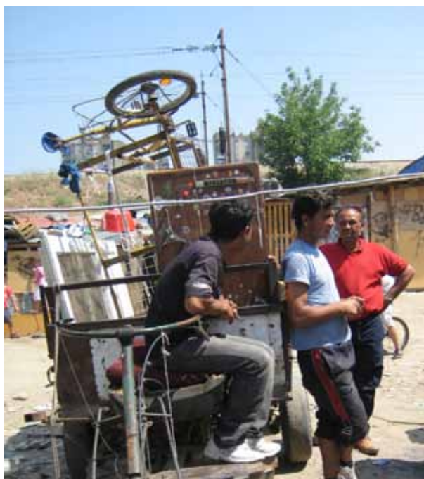
Internally displaced Roma people in an informal settlement in Serbia. Their prospects for integration are limited by their lack of livelihood opportunities (Photo: IDMC/Barbara McCallin, May 2009).