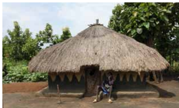
An IDP in Yei, Southern Sudan, in front of his traditional mud and thatch tukul (Photo: IDMC/Nina Sluga, June 2010).

Each group was asked to identify the main challenges to local integration with respect to their assigned theme and design recommendations for local, national and global organisations that would address the challenges and help facilitate local integration. Consideration was also to be given to: (1) participation of IDPs and host communities; (2) gathered versus dispersed settings in rural