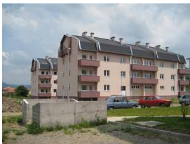
Social housing in Kraljevo, Serbia, for vulnerable IDPs who have been living in collective centres.