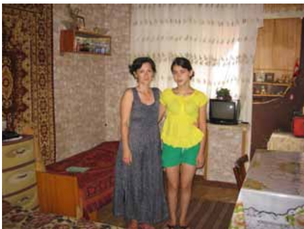
An internally displaced mother and daughter in the collective centre room they have lived in with other family members for over 15 years.

The seminar focused on the experiences of six countries with protracted internal displacement – Burundi, Colombia, Georgia, Serbia, southern Sudan and Uganda. For each country field research was commissioned and the resulting case studies were distributed before the seminar. Other background materials circulated to participants included an overview of local integration of IDPs in protracted displacement and reference materials relating to durable solutions.