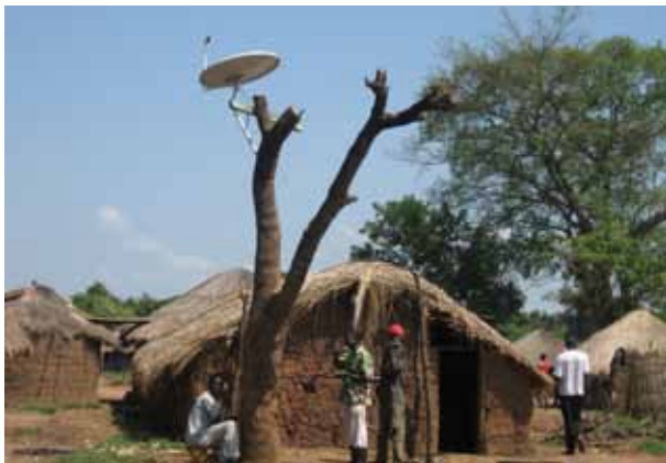
IDPs in a “transit area” near their place of origin in northern Uganda (Photo: IDMC/Cecilia Jimenez, November 2009).

Uganda and the vast majority of IDPs in Georgia and Serbia, where local integration was their only option since they could not return for physical or political reasons. Until they can enjoy freedom of movement, including to places of origin, and make an informed and voluntary choice of where to settle, they will not achieve durable solutions. The case study on Serbia highlighted the concept of “interim integration,” as put forward by the UN RSG on the human rights of IDPs 4 and the Framework on Durable Solutions for Internally Displaced Persons . The Framework refers to measures allowing IDPs to integrate locally while retaining the prospect of an eventual return. Funding interim solutions will not close the displacement chapter, but may provide a more cost-effective and sustainable resolution to the humanitarian effects of displacement. In any case, IDPs should not face any obstacles to accessing their rights for reasons related to their displacement, regardless of whether they have chosen where to settle.