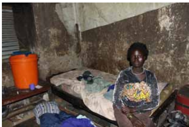
An IDP squatting in a house in Yei, Southern Sudan. Since displaced home owners started to return in 2005, occupying IDPs have been forced to move out, often without receiving compensation or any alternative plot.