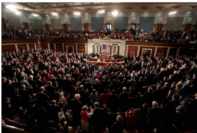
U.S. Speaker of the House Pelosi swears the members of the U.S. House of Representatives into office on the first day of the 110th Congress in Washington.

Barack Obama's triumphant presidential campaign in the 2008 election generated extraordinary interest and excitement in the United States and around the globe. Following on the heels of sweeping Democratic gains in 2006, this second Democratic victory was driven by a sharply negative referendum