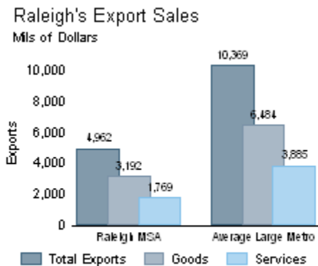
Brookings Institution analysis of various data for Raleigh-Cary, NC MSA

Raleigh produces $5.0 billion in total exports. As a share of its total economy, 9.8 percent of what it produces was exported in 2008, supporting 33,652 jobs. Recent export growth in Raleigh has been about average, expanding at 8.7 percent. Average wages in its largest export industry were $90,291, much higher than U.S. average. The metro has 7 export industry clusters. Finally, its major export industries are Chemical Manufacturing, Computer and Electronic Product Manufacturing, Royalties from Intellectual Property, Business, Professional, and Technical Services, and Machinery Manufacturing.