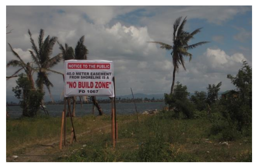
Tacloban City, Leyte

was recommending that LGUs enforce "no-build zones" (NBZs) within 40 meters of the high water mark in all coastal areas of Leyte and Samar affected by the typhoon.