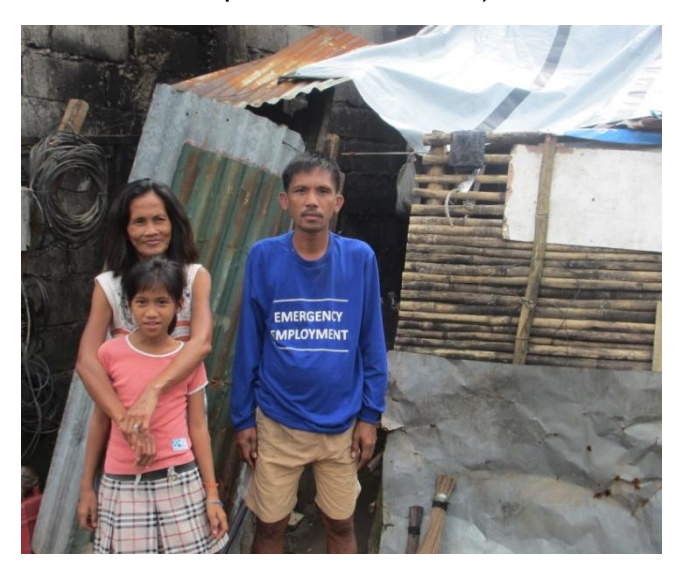
Tacloban City, Leyte

By early November 2014, a year since Haiyan hit, no more than several hundred families had been relocated to permanent houses.<sup>34</sup> In Tacloban City, where the Mayor hopes to relocate 14,400 families by the end of 2015, only 52 permanent homes had been completed on a site that, as of the end of November 2014, had yet to be hooked up to utilities and services.<sup>35</sup> In Guiuan, where the city plans to resettle 12,000 families from three coastal barangays devastated by the storm ( Barangays 6, 7, and Hollywood), the NHA had not completed construction of any permanent shelters (although 130 families had been relocated to single-family temporary shelters built by the International Organization for Migration (IOM) in Barangay Cogon intended eventually to be converted to permanent homes).<sup>36</sup>