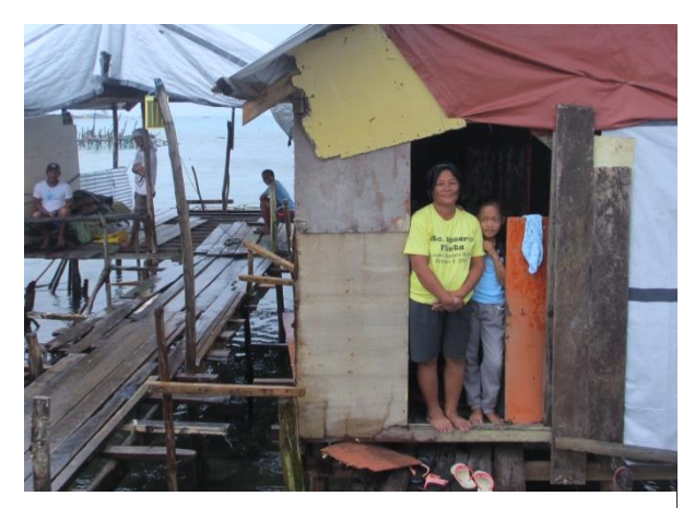
Guiuan, Eastern Samar

Physical relocation is also taking place in the absence of public transportation systems or subsidies for private transport that would allow resettled families to access jobs, schools, hospitals, or other social services in their former barangays. In Guiuan, approximately 130 families who previously resided along the water in a barangay that was totally wiped out by the typhoon have been relocated to a plot of land located a few kilometers inland (in Cogon Barangay). However, because no given the site's distance from the coastline.